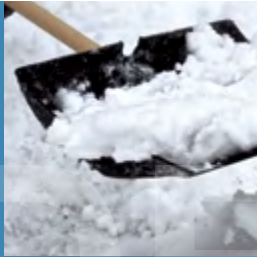
Keep sidewalks shoveled Page 3