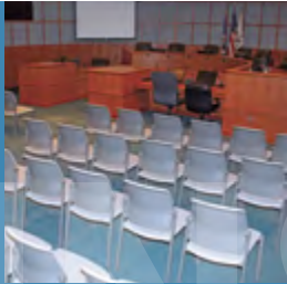
Council Chambers remodel begins Page 1