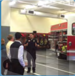
Apply now for Citizens' Academy Page 2