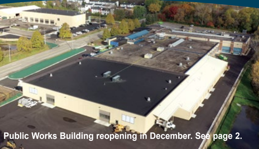
Public Works Building reopening in December. See page 2.

November/December 2019 • Volume 20, No. 10