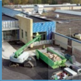
Public Works building reopening Page 2