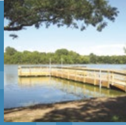
Review of 2020 budget priorities Page 3