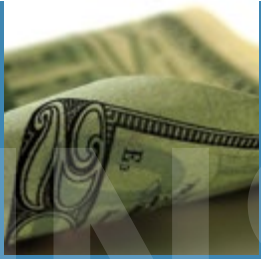
Budget meeting set for Dec. 11 Page 1