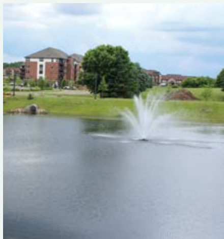
Water from this stormwater pond in the Bielenberg Gardens development is reused for irrigation.

Parkway and Hudson Road) are also using this technology to treat surface water and conserve valuable drinking water. The city expects to see more stormwater reuse systems installed in new development areas in future years.