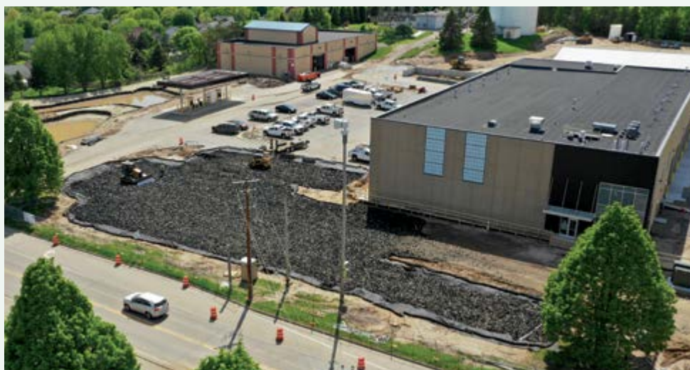
Tire-derived aggregate (TDA) is a unique stormwater technique being installed under the parking lot of the new Fleet Services Building on the west side of Tower Drive, south of Valley Creek Road. This basin (above) will be paved over with porous pavement to allow water to soak through slowly back into the ground.

This is the first time TDA has been used to treat stormwater in the community.